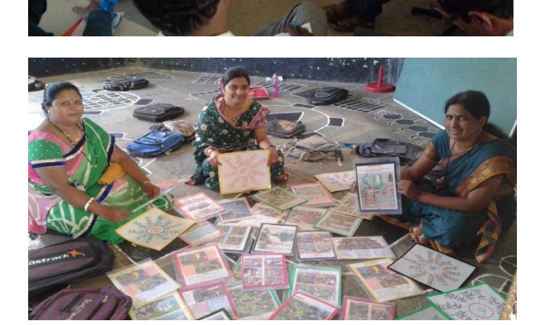
TLM preparation by teachers in ZP School Gujar, Bhawali,

Language Workshop at Bhamragad, Gadchiroli