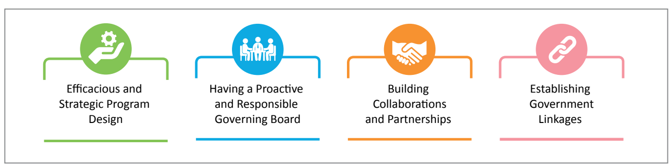
Figure 2: Identifying Best Practices