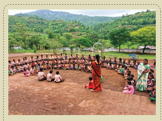
The Assembly at Kulnagana